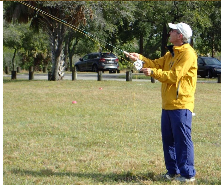
Thanks to all who participated and organized our casting clinic. This was a great event for Club members and we supported the Fly Fishers International.