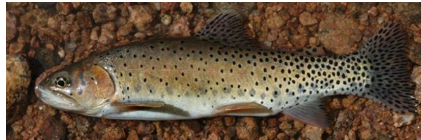
Photo left shows Bruce Anderson fishing Lake Zimmerman, 50 miles west of Ft Collins, CO. We were after native greenback cutthroat (pictured below), but no luck that day. They are usually rising among moose feeding in the lake. Zimmerman is at 10,500 feet after a 1 1/3 rd mile uphill hike. I took several breaks along the way, but worth it!

We are canceling our 2 September meeting due to the continued threat from COVID. We will try again on 7 October at Compton Park. Meanwhile, stay vigilant and safe.