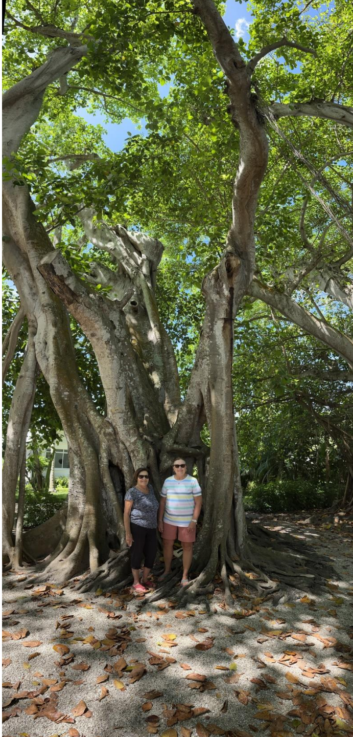
Banyan trees and shells on Gasparilla Island